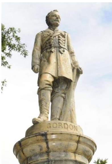
Statue of Gordon in Gravesend

By 1860 he was in Shanghai, where the opium wars were smouldering, and the French had, to his disgust, looted the Summer Palace at Peking. He got on well with the Chinese, having taken pains to learn Mandarin, and this eventually caused him to be put in charge of the Chinese (or ‘Ever-Victorious’) army, which was confronting the rebels in its borders; he re-organized it and drilled it, creating (as Cromwell had done) a ‘New Model Army’, and helping to end the Taiping Rebellion.