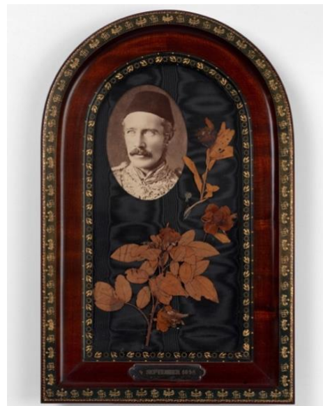
Photo of Gordon with pressed roses from his garden in Khartoum, Royal