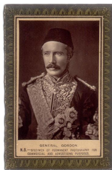
Gordon as Governor of the Sudan