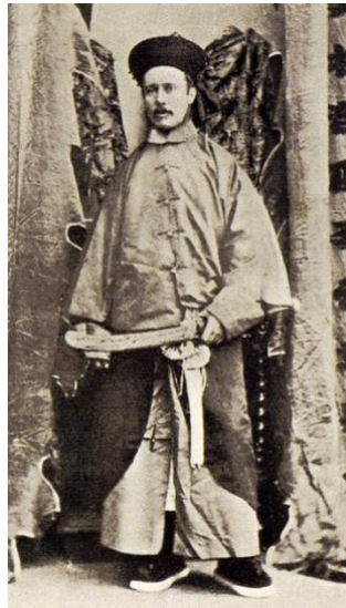
Gordon in Shanghai

As a small child his family had moved from Scotland to Dublin, where his experience of the rural (starving) poor lodged in his mind as a problem to be solved. He was sent to school at Taunton, where he was terrorized by cricket, and then to the new and rather experimental military school at Carshalton House, Croydon, where he disdained authority, and was bullied, finally getting into the Royal Engineers rather in spite of himself. His first posting was to the Crimea, where war had broken out in 1854, and where he met his best friend, a half Armenian Italian called Romolo Gessi, who introduced him to the complexities of Balkan and Ottoman politics. Gordon was employed to redraw the Russian–Turkish border, discovered the horrors of the slave trade (Russians, enslaved by Turks), and amused himself with wolf-hunting.