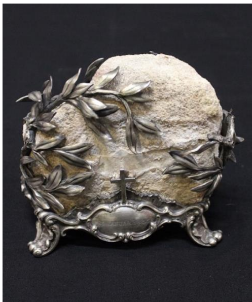
Memorial to Gordon, Royal Engineers Museum, made from a stone from the steps of his palace Collection in Khartoum, where he was reported to have been cut down.

The portrait painted of him in this book is of an unusually upright man, who constantly questioned the meaning of life and his place in creation, and strove to help the poor and trammelled. It's a particularly readable account of the life of a man who was a hero to many, and who still appears (if mercurial) unfashionably heroic.