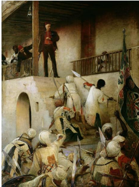
George William Joy, General Gordon's last stand , 1893, Leeds Museum & Art

In the same way, when he was reposted to the Royal Engineers at Gravesend, he set about organizing help for the hundreds of 'waifs and strays' in the area, teaching at the local Ragged School, and giving away most of his possessions to fund clothes for them. Over five years, he taught around 500 boys, more than 200 of whom were then able to find jobs. He then moved on to Egypt, but found there was little to do from an imperial point of view, and so in 1873 he left the British Army for the Egyptians, and then for the Governorship of the Sudan – a path which led inexorably to his death at the hands of rebels.